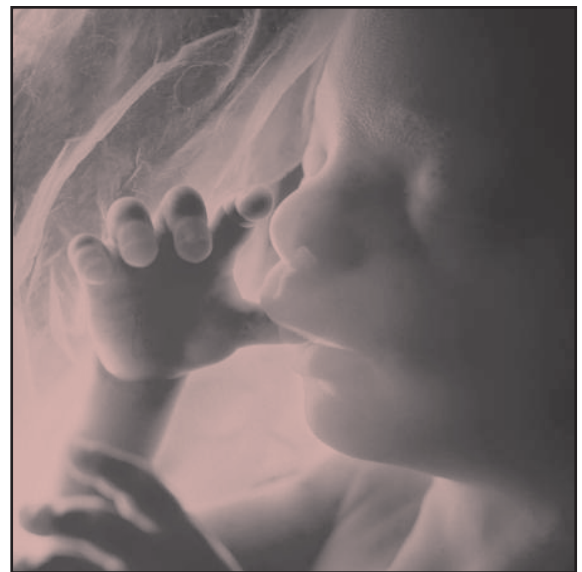
Fetus at 4 1/2 months

For women younger than 18, they need parental consent to have their ears pierced or medications administered at school. However, in the case of abortion, there is no requirement for parental consent. Given the risks associated with having an abortion, such a situation does not assure that informed consent is present.